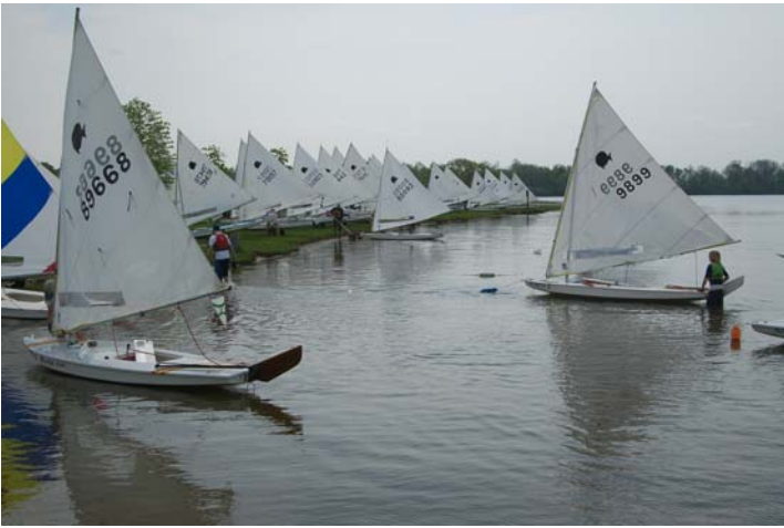
Sunfish prepare for the HSC SANJL Regatta