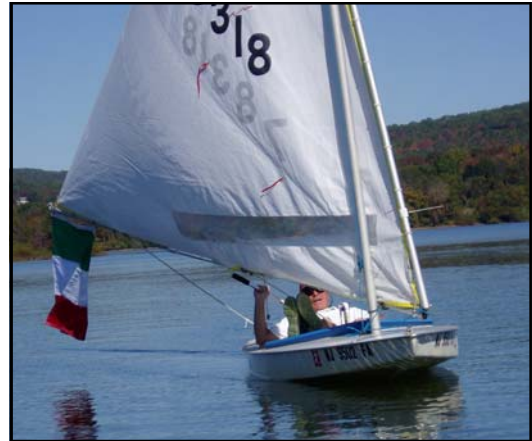
A Perfect Columbus Day at HSC!