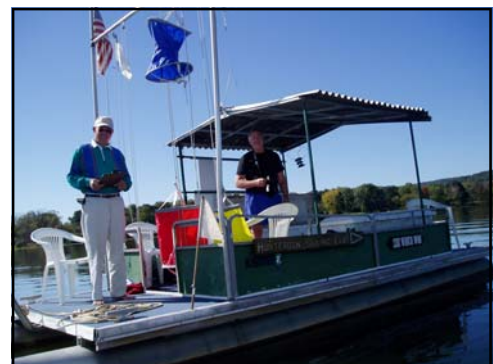
Remember to check in before the start!